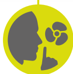
Silent cooling stand