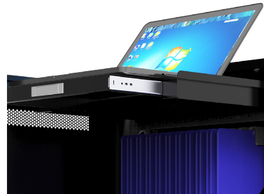
Sliding rack for notebook up to 17"

Tiroirs coulissants pour notebook jusqu'à 17"