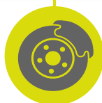
Omni directional wheels + brakes