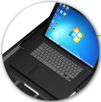
1 sliding rack for notebook 1 tiroir coulissant pour notebook