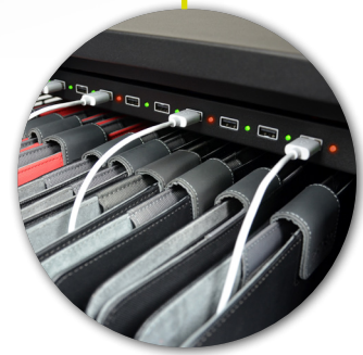
Charge progress LED indicator Indicateur LED de progression de chargement

FOR TABLETS, NOTEBOOK ELECTRONICS DEVIVES