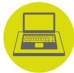
Sliding rack for notebook