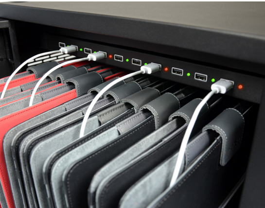
Charge progress LED indicator