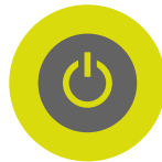
Charge indicator LEDs