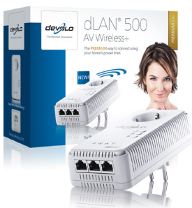
dLAN® 500 AV Wireless+