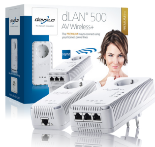
dLAN® 500 AV Wireless+ Starter Kit