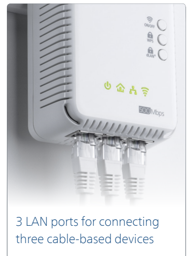
3 LAN ports for connecting three cable-based devices

In the dLAN® 500 AV Wireless+, devolo combines all the features of a high-performance Powerline adapter in one housing. Integrated WLAN for an optimal connection to wireless terminal devices such as a smartphone or laptop, three LAN ports for connecting network-compatible devices. Using the integrated electrical socket, power strips and other devices up to 16 amps can be connected. Never has it been easier, faster or more secure to network wireless and stationary devices!