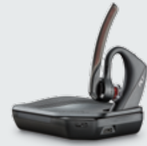
Charges while docked