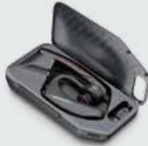
Charging case (Sold separately)